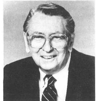
Macdonald Carey, 80, holds the record for being the longest-working actor under contract to NBC. He acted in 40 major motion pictures from 1942-1980. He is perhaps even more famous for his 25-year career playing the character Dr. Tom Horton on "Days of Our Lives." One of Hollywood's most prolific and versatile stars, he has appeared on stage, radio, television, and film.